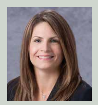
Written by Kristin Rognerud, Financial Advisor

Estimated % of Goal Funded Average Return Bad Timing Average Return 100% 100% 100% 100% 10 Basic Living Expense 10 Active Retirement 10 Pre-Medicare Healthcare Safety Margin (Value at End of Plan) $1.838 $1,363 $951 $219 Current dollars (in thousands): Future dollars (in thousands): $4.023 $2 984 $2.081 $480 Monte Carlo Results Liklihood of Funding All Goals Your Confidence Zone: 70% - 90% In Confidence Zone Above Confidence Zone This is a hypothetical illustration and not intended to represent performance of any investment strategy. This image is reproduced from the Goal Planning & Monitoring financial planning software, ©PIEtech, Inc. Used with permission. Degrees of confidence will vary depending on data input.